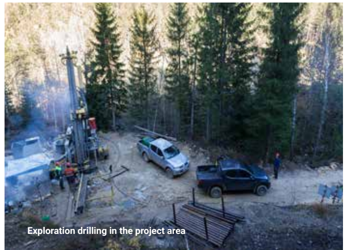
Exploration drilling in the project area

The Tara Resources team has significant experience in zinc mining and smelting.