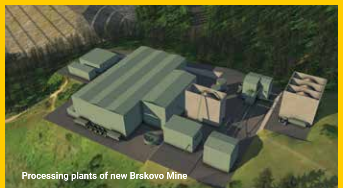
Processing plants of new Brskovo Mine

The open-pits, processing plant and the waste management facility will all be in the former mining operations in the hills above Mojkovac, far away from the urban area. Due to the hilly terrain of the region, the mining area will be largely hidden from Mojkovac, the planned ski-fields and the national parks in the area.