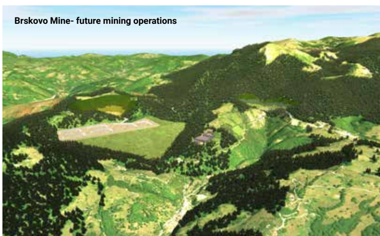
Brskovo Mine- future mining operations