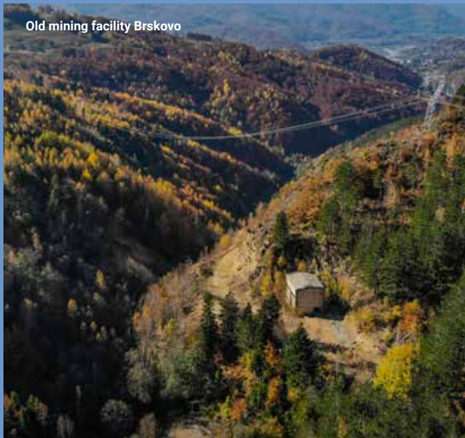
Old mining facility Brskovo